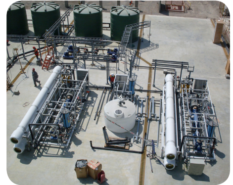
RO Installation at Michilla